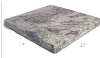
Column Cap, Bristol Black