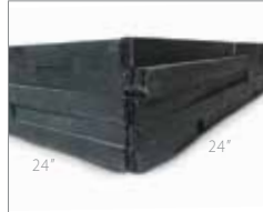
Natural End as Corner