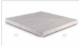
Hearth Type A, White Birch