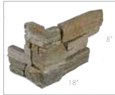
Estate Stone Corners