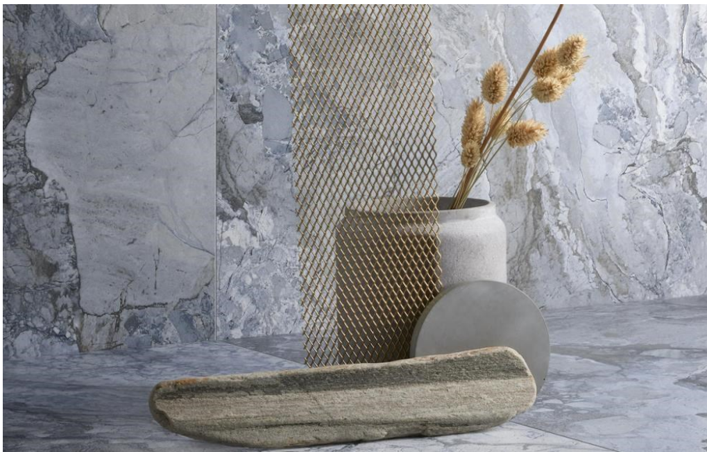
Angel Heart– Light Blue 12"x24"

Take a moment to let the Vibrant depth of the Angel Heart line sink in.