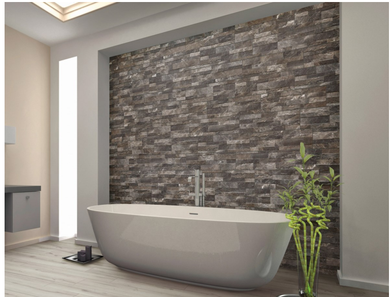
Rondine Ledger– Greige 6"x24"

We are excited to offer our first stock porcelain ledger panels. 6"x24" stone look ledger panels give you the timeless look of stacked stone, without the cost or maintenance.